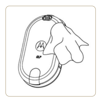
Clean the two-way radio with soft wipes.