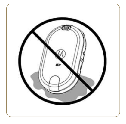
Do not use before the two-way radio is completely dry again.