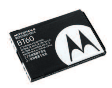
Motorola battery (article number MO-HKNN4014)