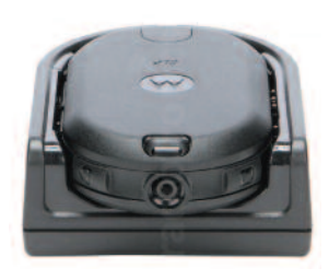
Motorola Single charger (article number MO-IXPN4028A)