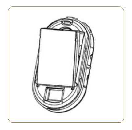
Turn off and remove battery.